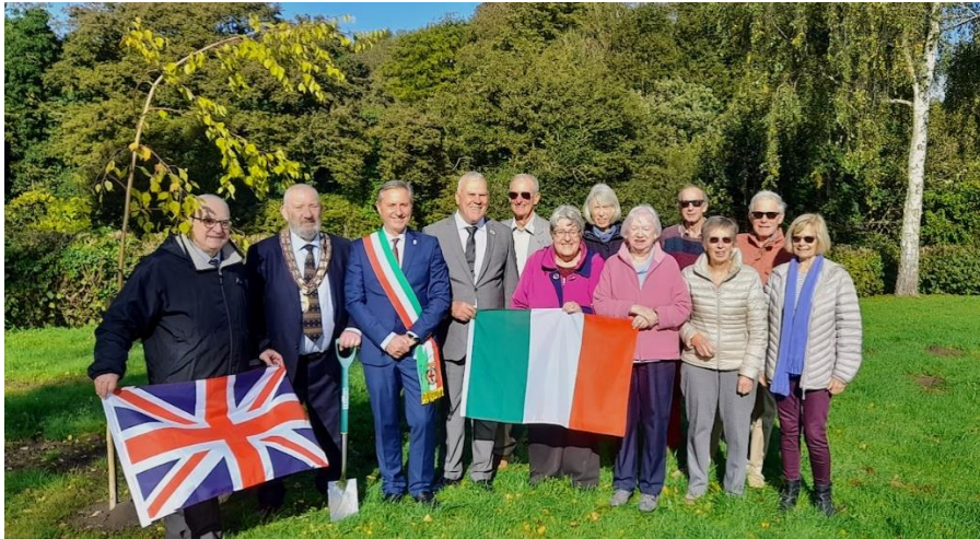
Planting of the "Silver Anniversary Tree" at Jubilee Fields

October 2023 saw the 25 th or Silver Anniversary of our twinning with Montecchio Maggiore. To mark the occasion, we were pleased to welcome a small delegation from Montecchio who arrived here on 12 th October – the first time we had met since the pandemic.