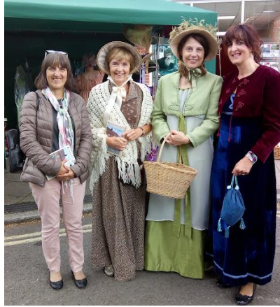
A reminder of 2018

our French friends come for the first part of the week when there will be plenty of Regency activities taking place. So, if you are planning to host or meet up with our visitors, please keep the days around the weekend of 22 nd /23 rd June free. Their precise dates of arrival and departure will be circulated once they are known.